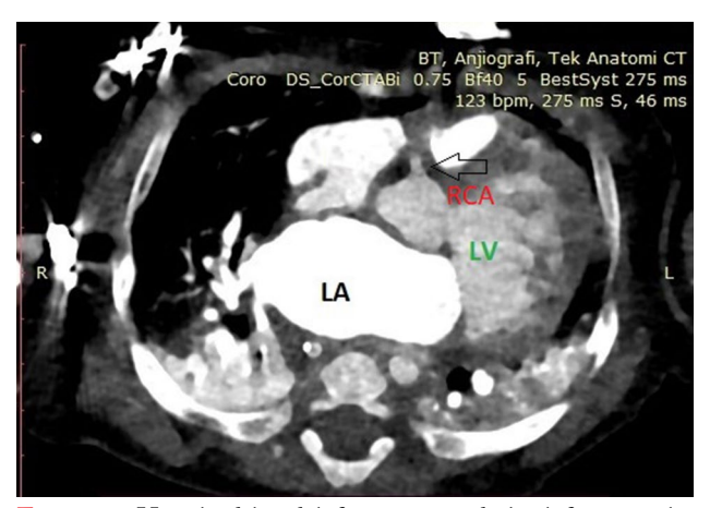
Figure 2. Hugely dilated left atrium and the left ventricle, the right coronary artery, and the absence of the left coronary ostium.

The patient had small ischemic lesions on the left frontoparietal, left thalamus, and basal ganglia on a computed tomography scan, which was evaluated by a pediatric neurologist. The patient underwent surgery under anticonvulsant treatment according to the recommendations of the pediatric neurologist. The patient could be referred for left ventricular assist device implantation or the transplantation list because of dilated cardiomyopathy. However, the patient was not in a position to wait long on the transplantation list. In addition, the need for lifelong anticoagulation treatment under ventricular assist device support could increase the risk of cerebral events. Therefore, we preferred surgical correction.