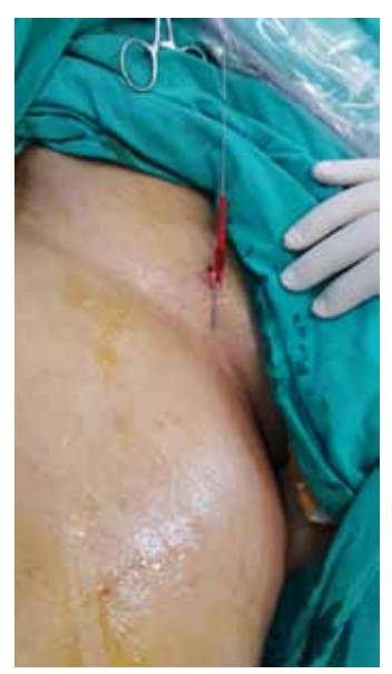
Figure 1. The retrograde puncture of the great saphenous vein on the groin level (Case 1).

completely ablated from below the knee level to the 3 cm distal of SFJ.