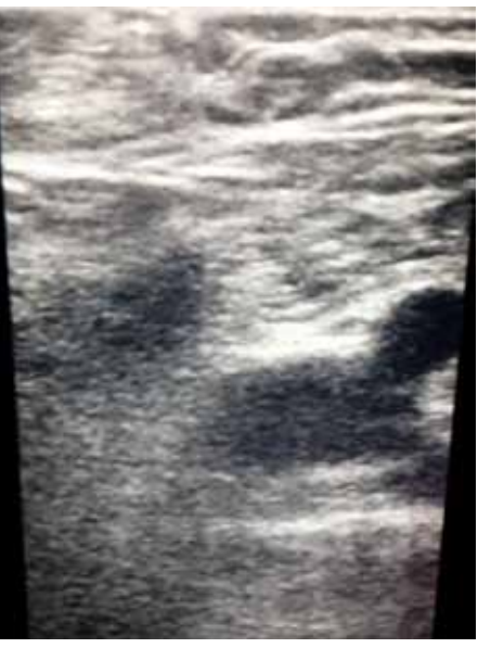
Figure 2. B-mode ultrasound view: common femoral vein, great saphenous vein, common femoral artery and guide-wire.

Case 2– A 51-year-old female with a weight of 88 kg and height of 1.59 cm was admitted. She was obese with a body mass index of 34.8 kg/m<sup>2</sup>. She was admitted due to visible varicose veins and edema on left