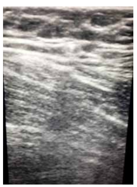
Figure 3. B-mode ultrasound view: radiofrequency catheter in great saphenous vein 3 cm distal of saphenofemoral junction.

leg. Physical examination findings were remarkable for palpable varicosities on cruris and venous congestion. Duplex examination showed a four-second reflux of the left SFJ in erect position during Valsalva's maneuver and the GSV diameter was 6 mm at the junction level. Radiofrequency ablation for GSV was scheduled.