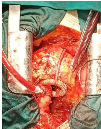
Figure 1. Intraoperative image of the modified Cabrol technique.

Keywords: Bentall procedure, coronary artery pseudoaneurysm, coronary button pseudoaneurysm, modified Cabrol technique.