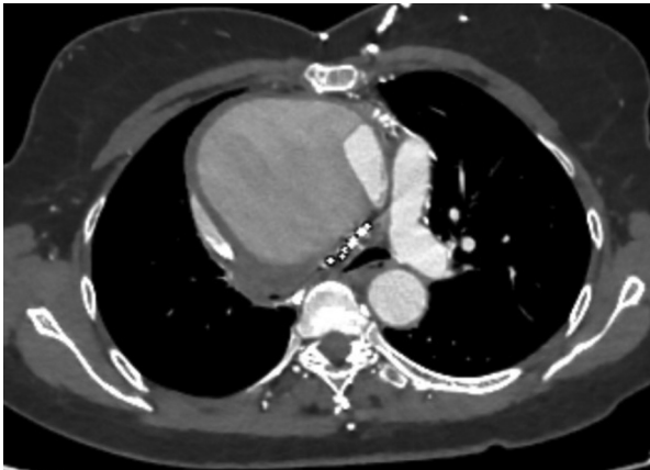
Figure 2. Pseudoaneurysm compressing the right pulmonary artery and trachea.