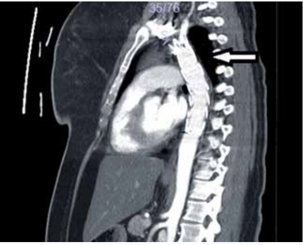
Figure 6. Aortic coarctation postoperative six months computed tomographic image, white arrow shows corrected segment.

In this case report, we performed direct stent implantation, as there was enough diameter to permit the stent placement into the coarcted segment. Then, we opened the self-expandable stent. We also performed