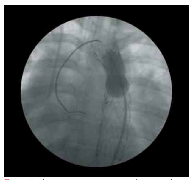
Figure 3. Aortic coarctation angiographic view during balloon dilatation.

postoperative treatment of hypertension.<sup>[1]</sup> These patients with primary adult aortic coarctation may suffer from upper extremity hypertension, exercise intolerance and shortness of breath. These patients may have many associated cardiovascular comorbidities such as pulmonary hypertension, left ventricular hypertrophy and arrhythmias. After surgery, serious complications requiring revision can be seen. These are paradox hypertension, postcoarctation syndromes