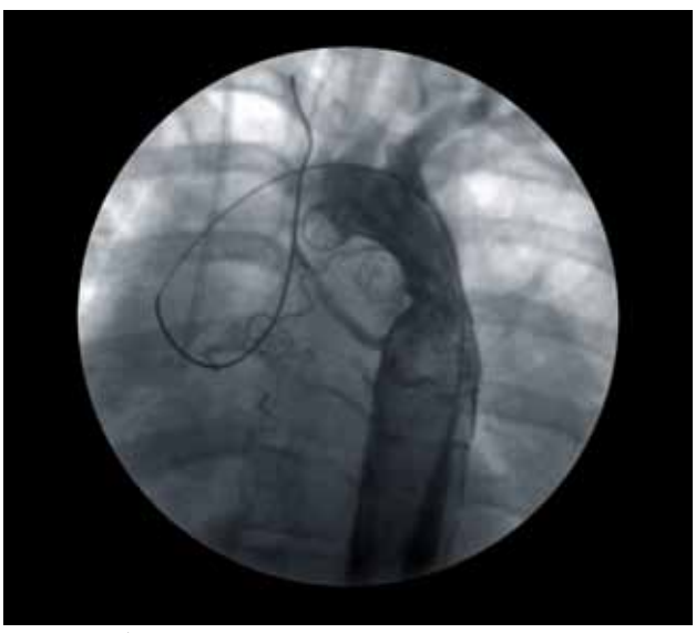
Figure 2. A ortic coarctation postoperative angiographic view just after direct stent implantation.

Patients with primary adult aortic coarctation have a decreased life expectancy, unless treated. Surgical repair was the only effective treatment option available in the past and was demonstrated to improve the