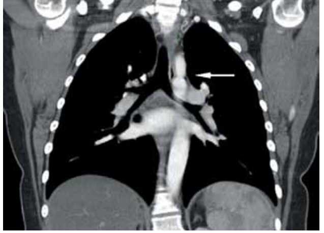
Figure 5. Aortic coarctation preoperative computed tomographic image, white arrow shows coarted segment.

characterized by abdominal complaints, paraplegia, stroke. Hemothorax, chylothorax, left recurrent nerve paralysis, left phrenic nerve paralysis, Horner's syndrome also occur. As late complications restenosis, ischemia of the left arm and aneurysm formation at the sugicaly corrected site could be seen. For this reason, less invasive methods like balloon angioplasty or stent implantation were preferred for primary adult aortic coarctation instead of surgery. Since recurrent coarctation might have seen or complications such as pseudoaneurysm at the anastomosis or aneurysm formation around the aortic tissue after the primary surgical correction, less invasive endovascular interventions have been described with good results despite high operative risk.<sup>[5]</sup> However, aortic coarctations in older adults have thicker, more resilient and extensive calcifications which increase the theoretical risk of rupture with vigorous balloon dilatation.<sup>[4]</sup> Furthermore, appropriate patient selection may decrease complication ratio.