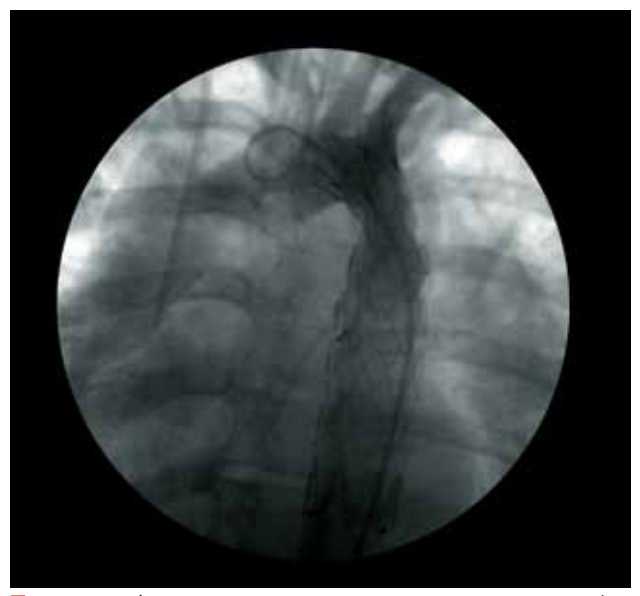
Figure 4. Aortic coarctation postoperative angiographic view.