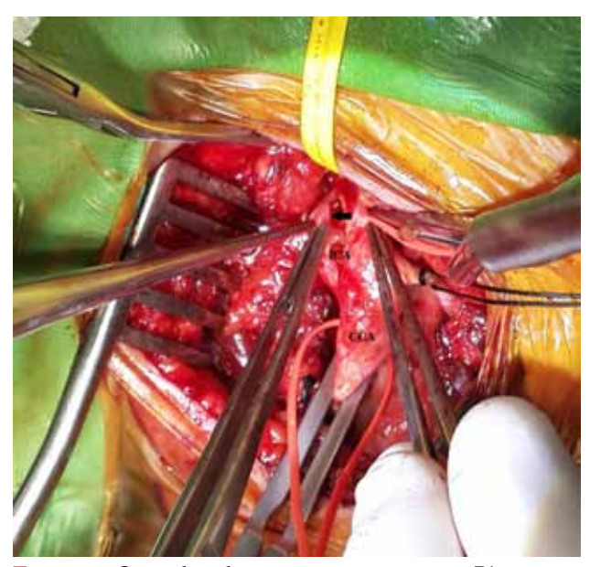
Figure 2. Carotid endarterectomy in progress. Plaque can be seen in the lumen of the common carotid artery (CCA) and the internal carotid artery (ICA). The pedunculated thrombus in the lumen of the ICA is also identified with a forceps (arrow).

using the shunt due to distal ICA systolic tension over 50 mmHg pressured after cross-clamping and the rSO_2 did not drop to more than 12% of the preclamping value during clamping.