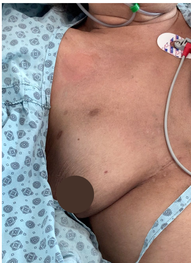
Video 1. Respiratory pattern of the patient.