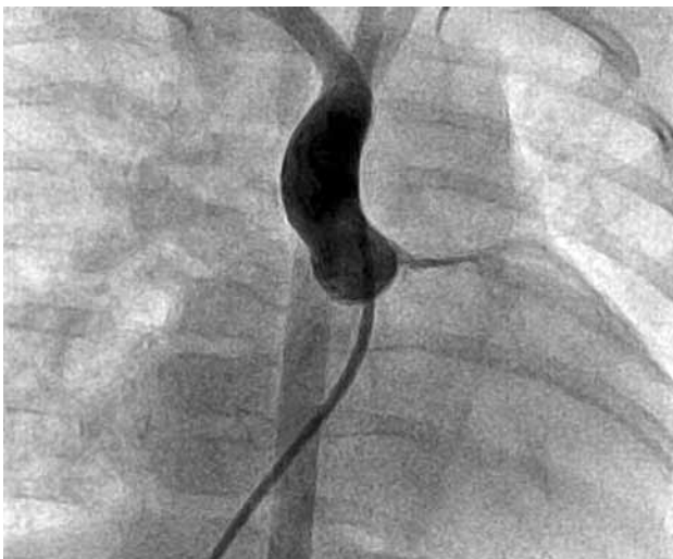
Figure 1. Preoperative angiography showing a single coronary artery.

A single coronary artery is a rare coronary artery origin anomaly which can be often associated with other congenital cardiac defects, such as ventricular septal defect. This anomaly is usually in benign nature and seldomly requires surgical intervention.