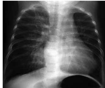
Figure 2. Preoperative radiography shows cardiomegaly.